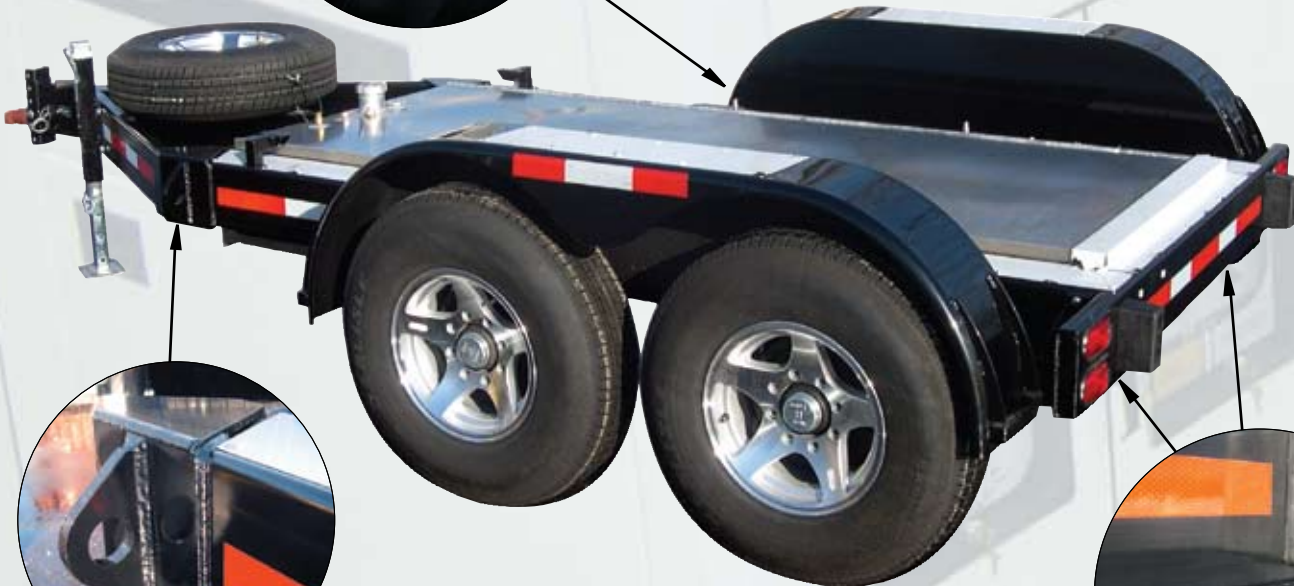
220KW Trailer (Optional)