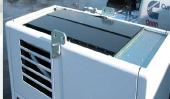
Top with Lifting Hooks Installed