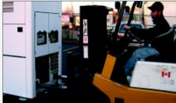
Integrated Fork Pockets