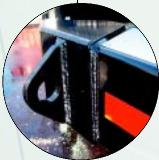
Chain Lift Hooks (Front)