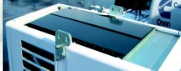
Top with Lifting Hooks Installed